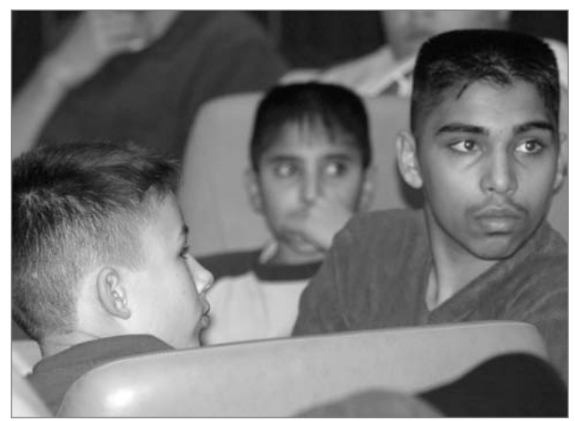
Young forum participants.

Some participants expressed the need to recognize current prevention efforts which were doing meaningful work that had an impact and to build upon these existing models while introducing new ones.