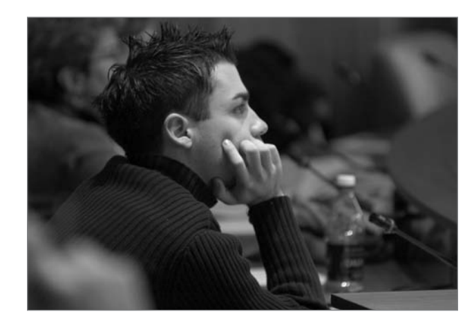
Participant listens intently to proceedings.

The Four Pillars strategy was developed as part of the City of Vancouver's effort to gain support for action by senior levels of government and the community, to address what had become a serious public health crisis in Vancouver's Downtown Eastside. Throughout the 1990s, deaths from drug overdoses had increased to historic numbers. HIV and hepatitis C among injection drug users were at epidemic levels. An open drug market had firmly established itself at the corner of Main and Hastings, and the level of property crime had become intolerable to those who lived and worked there and across the city.