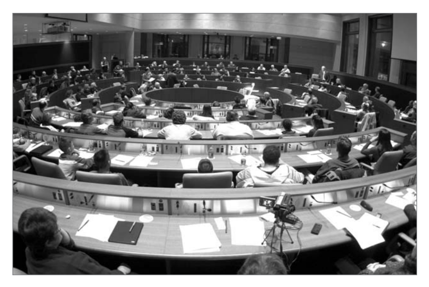
Asia Pacific Hall, Wosk Centre for Dialogue

The work that Vancouver is doing is part of an evolving 'bigger picture' across this country. The overall aim of Canada's National Drug Strategy is to create a society that is increasingly free of the harms associated with problematic substance use.