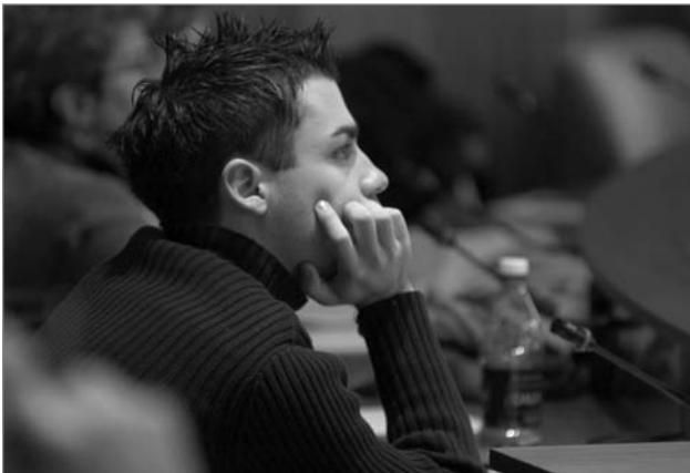
Participant listens intently to proceedings.

The Four Pillars strategy was developed as part of the City of Vancouver's effort to gain support for action by senior levels of government and the community, to address what had become a serious public health crisis in Vancouver's Downtown Eastside. Throughout the 1990s, deaths from drug overdoses had increased to historic numbers. HIV and hepatitis C among injection drug users were at epidemic levels. An open drug market had firmly established itself at the corner of Main and Hastings, and the level of property crime had become intolerable to those who lived and worked there and across the city.