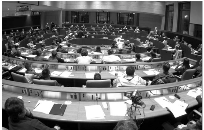
Asia Pacific Hall, Wask Centre for Dialogue

The work that Vancouver is doing is part of an evolving 'bigger picture' across this country. The overall aim of Canada's National Drug Strategy is to create a society that is increasingly free of the harms associated with problematic substance use.