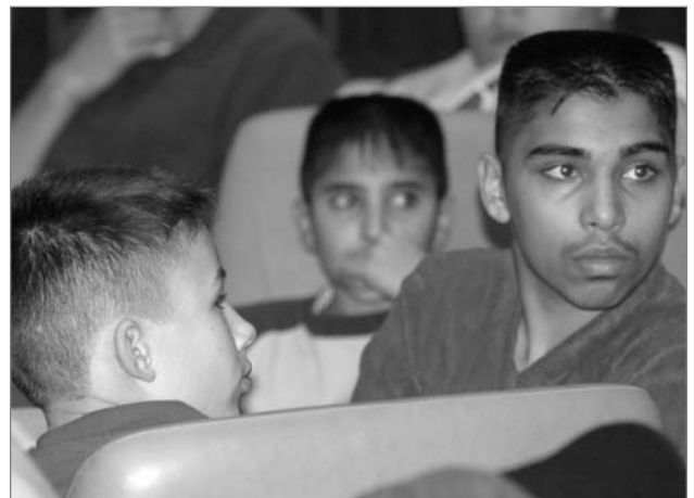
Young forum participants.

Some participants expressed the need to recognize current prevention efforts which were doing meaningful work that had an impact and to build upon these existing models while introducing new ones.