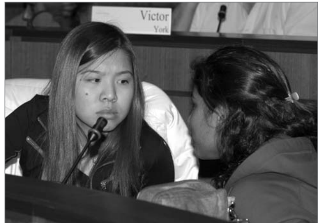
Participants from Windermere Secondary School